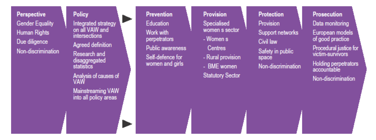
Figure 1: The original 6 P's of integrated VAWG strategies

Successive governments have concurred with the UN that VAWG is both a cause and consequence of gender inequality and a violation of women's human rights, or as the EU now terms them 'fundamental rights'. This recognises that the impacts are not just on individual victim-survivors but also on women as a social group; the harms of VAWG include undermining women's status and sense of self. Undoing harms requires addressing not just women's safety but their ability to "enjoy and exercise all fundamental rights and freedoms".